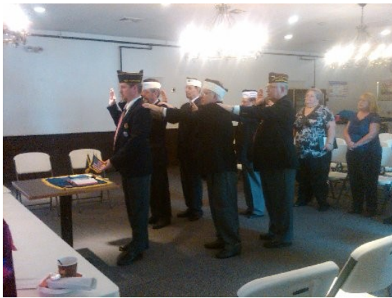
New District 6 Officer taking oath of office in Merrimack on 6 May 2012.