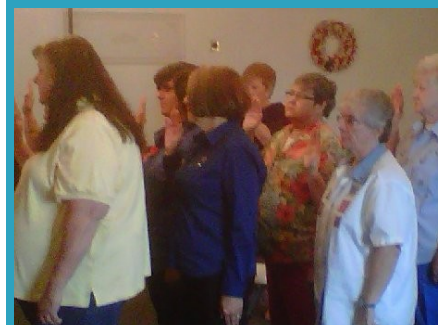
New District 6 Lady's Auxiliary Officers taking oath of office in Merrimack on 6 May 2012.