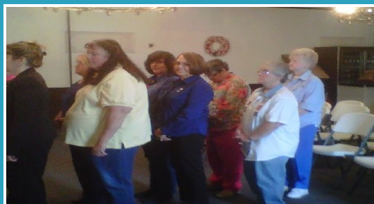
New District 6 Lady's Auxiliary Officers preparing to be sworn in at Merrimack on 6 May 2012.